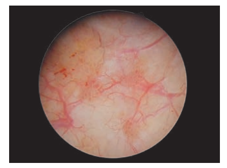
White light image