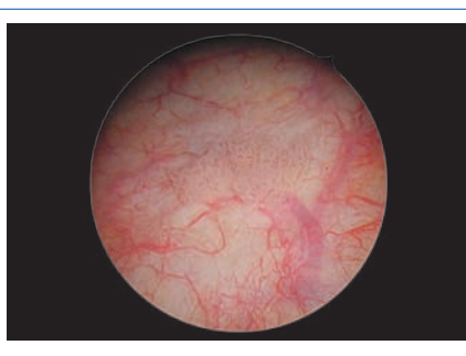
HDTV 1080 Image